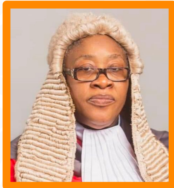
Hon. Justice Ekaette F. Obot Chief Judge. Akwa Ibom State