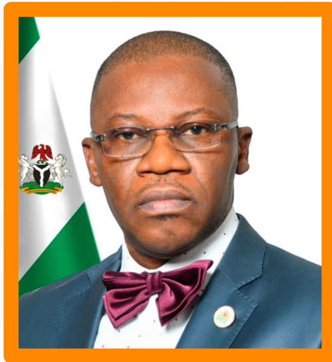
Sir Charles Udoh

Honourable Commissioner Ministry of Culture and Tourism & Chairman, Planning Committee